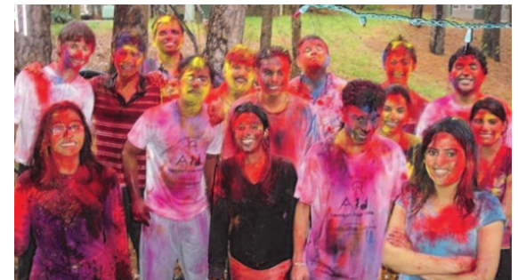
Holi celebration by Hindu YUVA, UNC Chapel Hill

Too many reasons to list here...come and see for yourself!