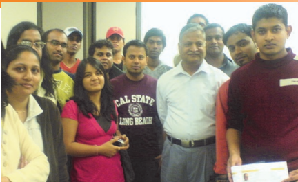
Vedic Math Workshop at California State University