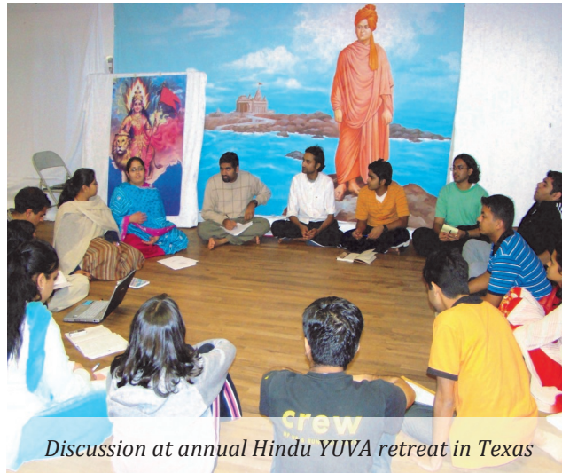
Discussion at annual Hindu YUVA retreat in Texas