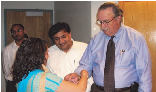
Celebrating Raksha Bandhan with local mayor